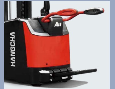
The integrated stamping molded guardrail offers better protection for the operator